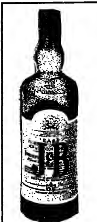
Make today a J & B Rare Day